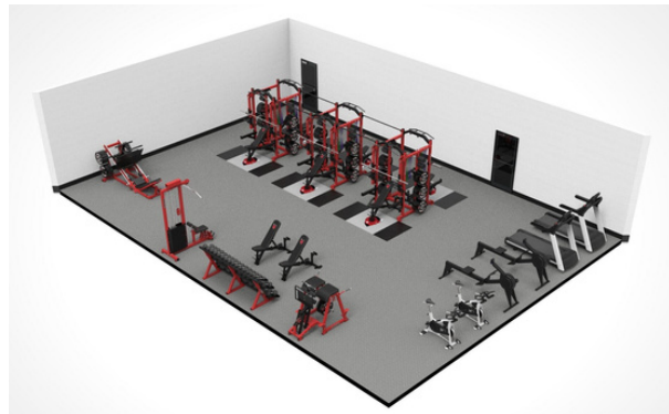
Pictured to the left is a design concept of what the weight room may look like when finished.

If you would like to add your support to this project, checks could be written to Lamoni Community Schools, 202 North Walnut, Lamoni, IA 50140, and note that the money is to be used for the fitness room.